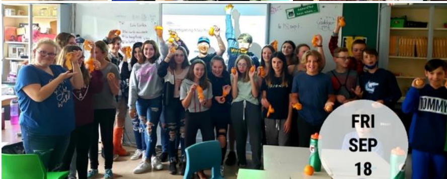
In their introduction to the mapping unit, grade 8 students in Mme. Breen-Harris' class explored how difficult it can be to turn a 3D object (globe) into a 2D object (map) and represent it accurately. Orange peels flattened on the desks do not look like an unpeeled orange!